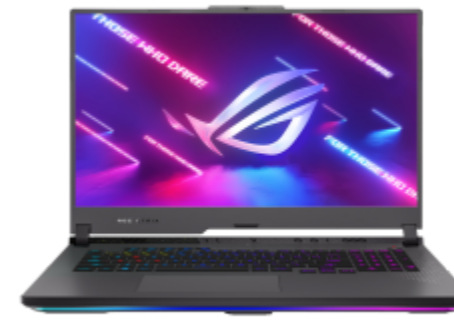
ROG Strix G17 (2023) G713 G713PI#B0BNQVMHT9