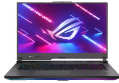
ROG Strix G17 (2023) G713 G713PI-HX049W