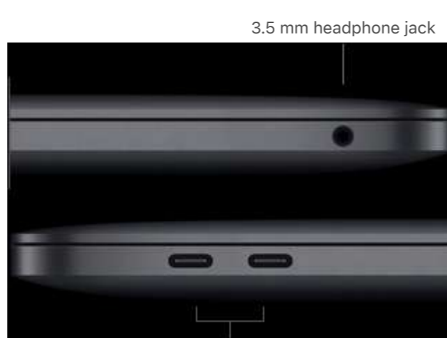
3.5 mm headphone jack