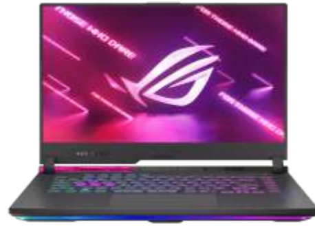
ROG Strix G15 (2022) G513 G513RM-HQ223X