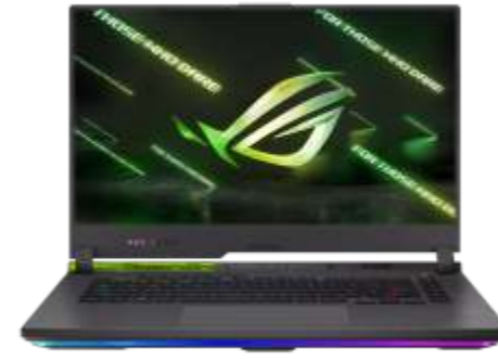
ROG Strix G15 (2022) G513 G513RM-HF232X