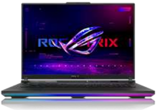
ROG Strix Scar 18 (2023) G834JZ