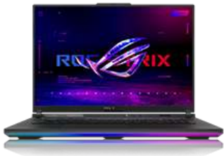
ROG Strix Scar 18 (2023) G834JY